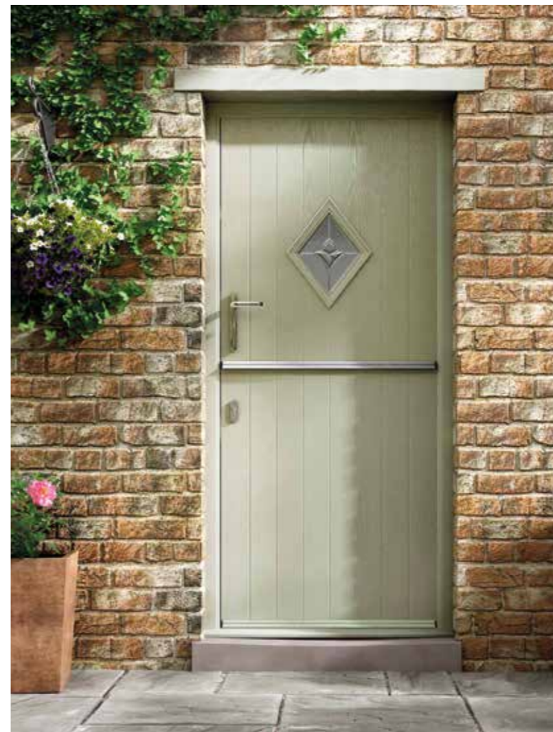
Image shown is a composite stable door. For more details please refer to our Magnum Composite Door brochure.